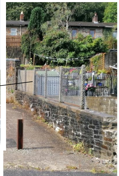
Fig 6 (Right): Existing boundary treatments to northern boundary.